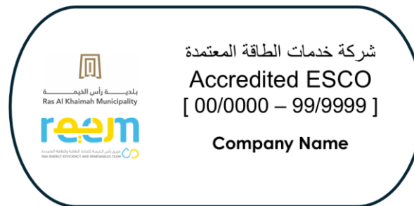
Figure 3. Official logo for Accredited ESCO

Accredited ESCOs will be authorized to use the official logo for Accredited ESCO with RAK Municipality. The logo template can be seen in Figure 3. Official logo for Accredited ESCO.